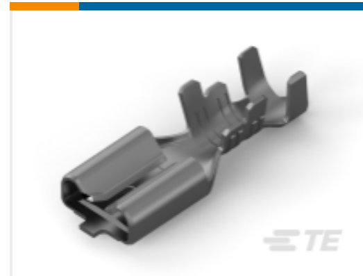
TE Part # 2238173-3 250 FASTON,REC.,22-12 AWG,TPBR