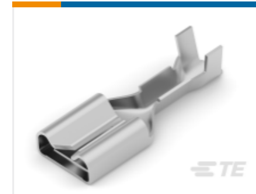
TE Part # 2238204-3 250 FASTON REC. 22-18AWG