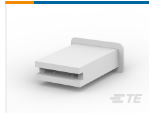
TE Part # 360041-1 187 FASTON HSG.,TAB,1 POS, NATRUAL