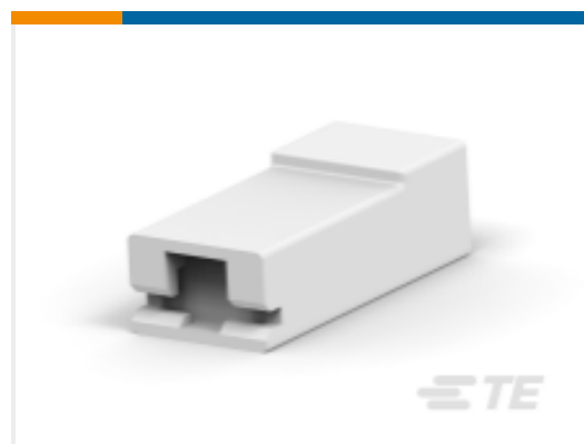
TE Part # 2-480416-4 250 FASTON HSG.,REC.,1 POS, NATRUAL