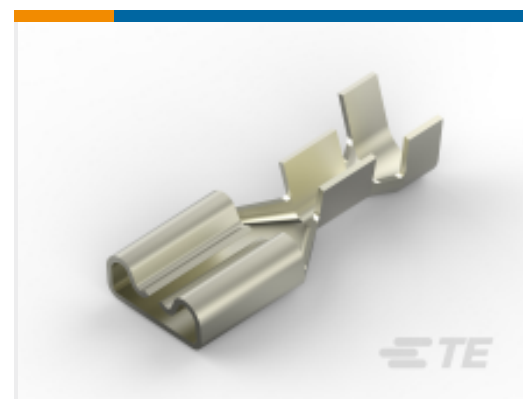
TE Part # 2238143-1 250 FASTON,REC.,22-18 AWG,NPST