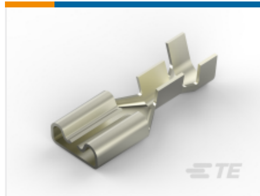
TE Part # 1742198-1 250 FASTON,REC.,18-14 AWG,NPST